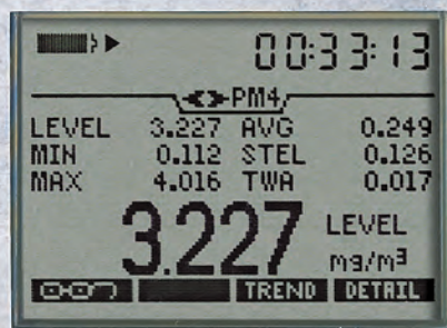
PARTICULATE CONCENTRATIONS SCREEN - Displays user-adjustable impactor setting and six simultaneous measurements.