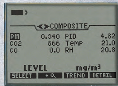
COMPOSITE SCREEN - Displays available parameters for a snap-shot overview of measurement values.