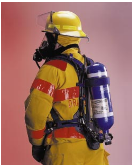
AirBoss Evolution SCBA