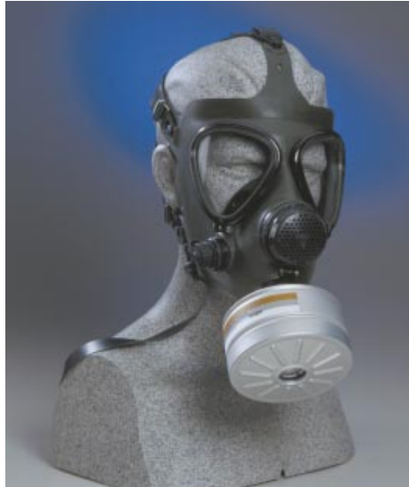
KARETA M Mask

Today, Dräger products provide unmatched comfort, safety and versatility to first responder and safety professionals around the world.