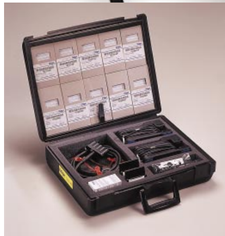
Dräger CDS Kit Part No. 6400565S