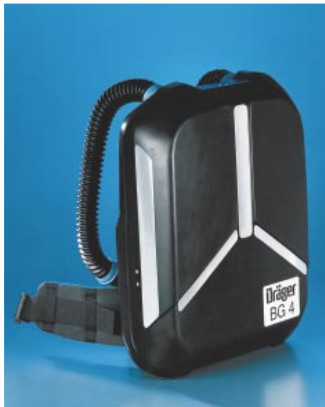
BG4 Closed Circuit Oxygen Rebreather