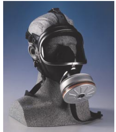
Panorama Nova Full Facepiece